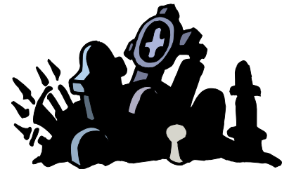
PLEASANT VIEW CEMETERY

If you can't or don't want to make a deal with the Necromancer you are asked to leave his mausoleum... and you must search the cemetery.